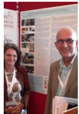
Presenting the proving in Malta

adds to the picture and the clinical use of the new remedies will expand the remedy picture.