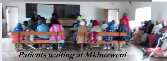
Patients waiting at Mkhuzweni

What has been noticeable this year has been the increase in the number of men attending the clinics and in general the elderly are those attending in the highest numbers. Some of these clinics are extremely busy and involve very long days which usually include at