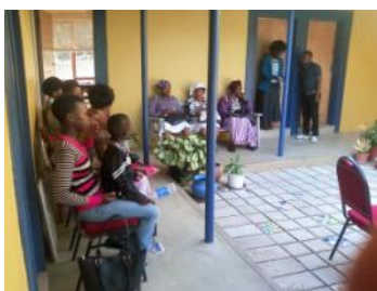
Patients at Ekuphileni wellness centre