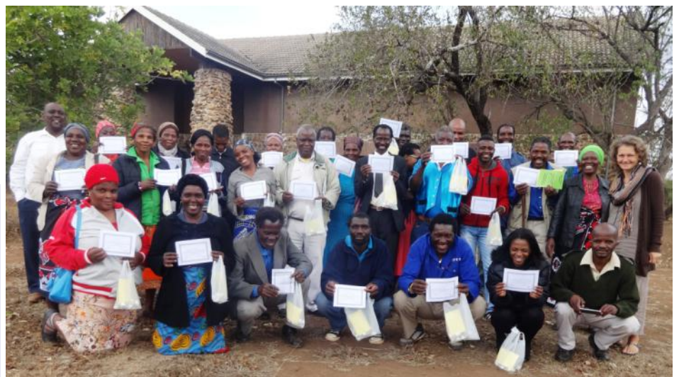
Traditional Medicinal practitioners Introduction to Homeopathy workshop.

Siphonochilus is a type of ginger and dies off in winter. In summer the bulbs are split and in this way, multiplied. By 2018 SHP will be able to distribute at least 80 plants. The Warburgia trees are very slow growing so 2 year old trees were sourced for distribution from the Kruger park in South Africa.