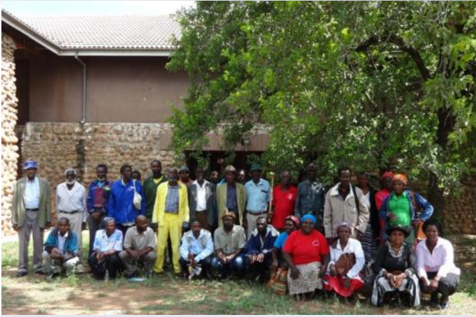
Traditional medicinal practitioners (TMPs) workshop at Mlawula