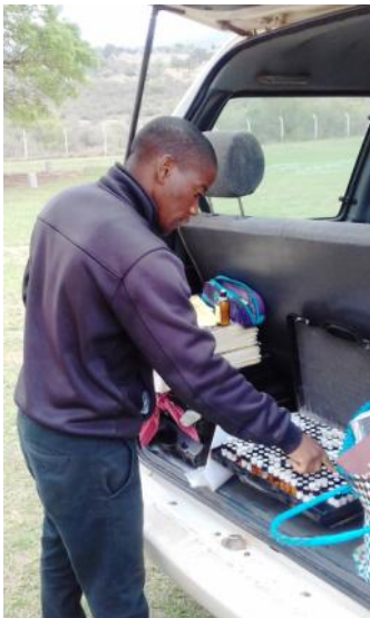
Outreach -dispensing from the car!

For more information on homeopathy and homeopathic research please contact us by email.